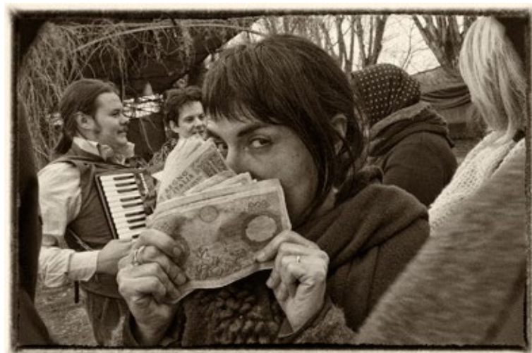
Winning in the raffle. La fiera di San Martino (in game).